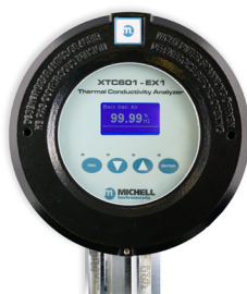
XTC601 Binary Gas Analyzer