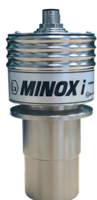
Minox i Intrinsically Safe Oxygen Transmitter