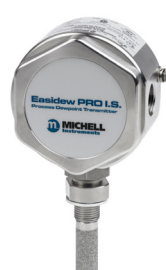
Easidew PRO I.S. Process Dew-Point Transmitter