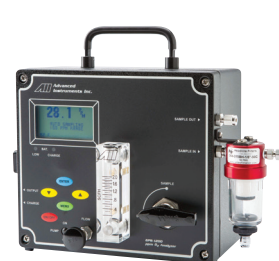
GPR-1200 ATEX Portable Trace Oxygen Analyzer