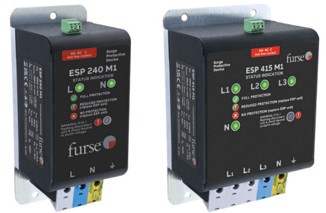
*NOTE: product label design may vary.

Combined Type 1, 2 and 3 tested protector (to BS EN 61643) for use on mains power distribution systems primarily to protect connected electronic equipment from transient overvoltages on the mains supply, e.g. computer, communications or control equipment. For use at boundaries up to LPZ 0 to protect against flashover (typically the main distribution board location, with multiple metallic services entering) through to LPZ 3 to protect sensitive electronic equipment.