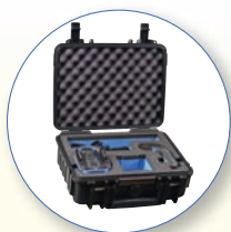
SA147 Waterproof Carrying Case for Noise Dosimeter and Single Docking Station