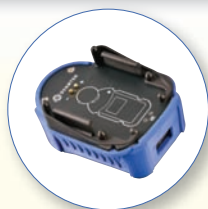
SA104-1 Docking Station for Single Dosimeter