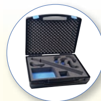
SA144 Carrying Case for 5 Dosimeters and Docking Station for 5 Units