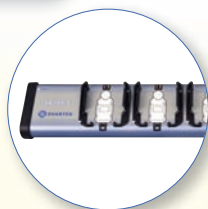
SA104-5 Docking Station for 5 Dosimeters