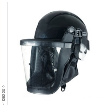
Dräger X-plore® 8000 Helmet with visor for X-plore® 7000