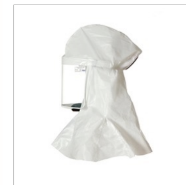
Dräger X-plore® long hood TH3, white