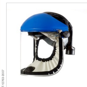
Dräger X-plore® protective AC visor