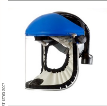
Dräger X-plore® protective PC visor