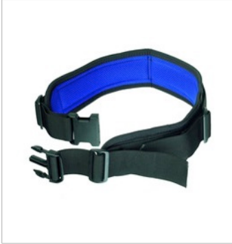
Dräger X-plore® standard comfort belt