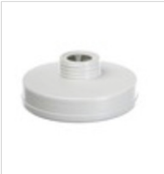
680 P3 R (incineratable) / TH/M3 P SL R