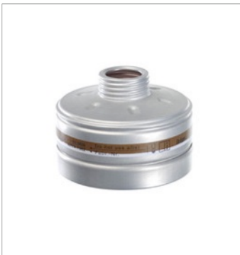
620 A2-P3 RD / TH/M3 A2 P SL R