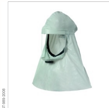
Dräger X-plore® long hood TH2, grey