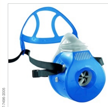
Dräger X-plore® 4740, silicone