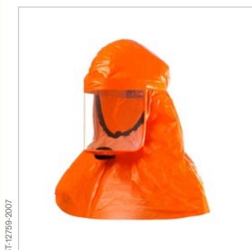
Dräger X-plore® long hood TH2, orange