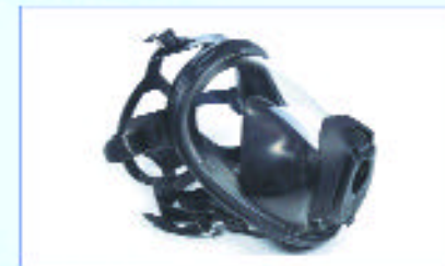
F2 Facemask P (EPDM) R54697 F2 Facemask P (Silicone) R54694