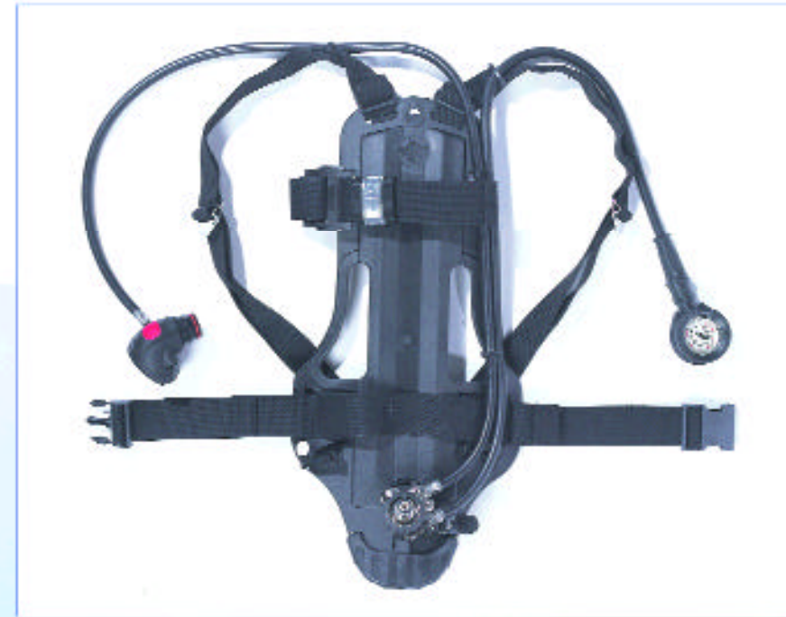
PA91 Plus Push in 5550685 PA91 Plus Push in (Italy) 5550685