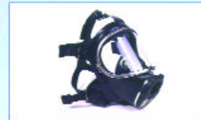
Panorama Nova Facemask P (EPDM) R52972 Panorama Nova Facemask PE M45 x 5 (EPDM) R51492 Panorama Nova Facemask P (Silicone) R53070 Panorama Nova Facemask Standard P (EPDM) R54550