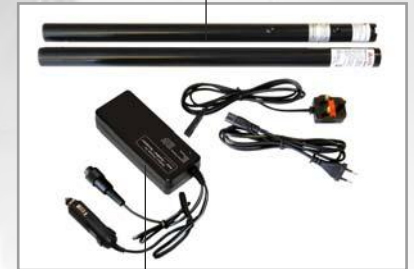
Solo 726 Fast Charger