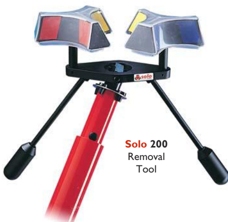
Solo 200 Removal Tool