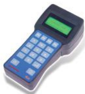
TLU Wireless (IR) Hand-held Terminal