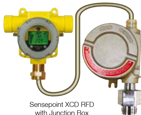
Sensepoint XCD RFD with Junction Box

Mount Sensepoint XCD RFD in ducts or on pipes, near ground-level for propane or ceiling-level for methane detection—whatever the situation requires. The transmitter includes two programmable alarm/fault relays as well as an industry standard 4-20mA output. Calibration and relay operation of the transmitter may be adjusted via the transmitters' backlit LCD. Outputs are automatically inhibited during adjustment thereby reducing the risk of false alarm at the control panel during maintenance. One-man, non-intrusive maintenance speeds and simplifies life on the job.